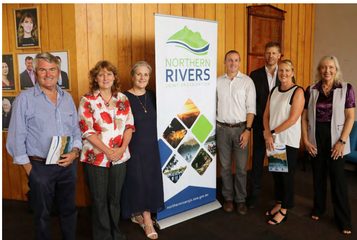
Launch of Northern Rivers Joint Organisation's Strategic Regional Priorities 2019-2022, February 2019

At a meeting of the Board of the Northern Rivers Joint Organisation at Tweed Shire Council on 8 February 2019, the Strategic Regional Priorities 2019 – 2022 document was formally launched. A workshop was then held where the five Strategic Regional Priorities were workshopped to identify the highest priority areas to pursue advocacy and project outcomes for the region.